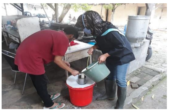
Figure 3. Cow's Milk Filtering Process

After the milking process goes through the filtering stage, the resulting milk is filtered. a strainer made of cotton or a clean white cloth. Milk is poured from one container to another and a filter cloth is placed in the mouth of the funnel which is intended for the milk container [8]. Filtering is carried out to ensure that no foreign objects enter and have the potential to damage the milk, such as hair and other impurities that enter the milk during milking [9].