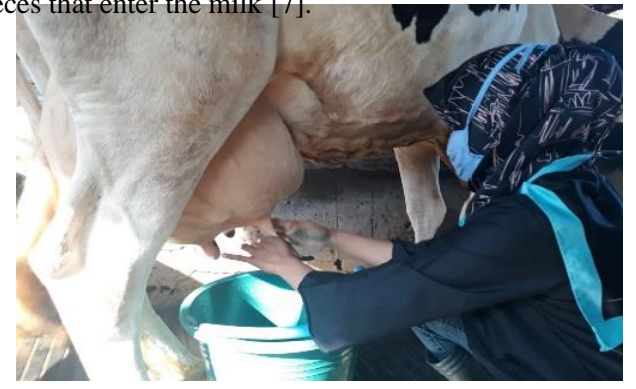
Figure 2. Cow Milking

Before milking the cow's nipples and udders must be cleaned first so that they do not become contaminated with feces that enter the milk [7].