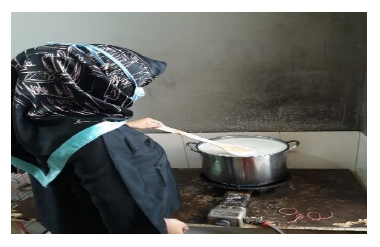
Figure 5. The Process of Heating Milk

Heating milk is done to kill microbes that destroy milk and kill germs in milk that can endanger human health. In heating milk or pasteurization in a susu abadi company, heating milk is brought to a boiling temperature to kill germs and pathogenic bacteria using a long pasteurization (law tempetarute long time) by heating milk which is carried out at a temperature that is not high for a relatively long time depending on the volume of the milk being heated at temperatures of 62-65°C for ½ - 1 hour [11]. The milk is heated until it boils and then stored in a safe and clean place. The heating of the milk must be done by constantly stirring so that there is no clumping of milk fat, it must be done carefully so as not to burn [12].